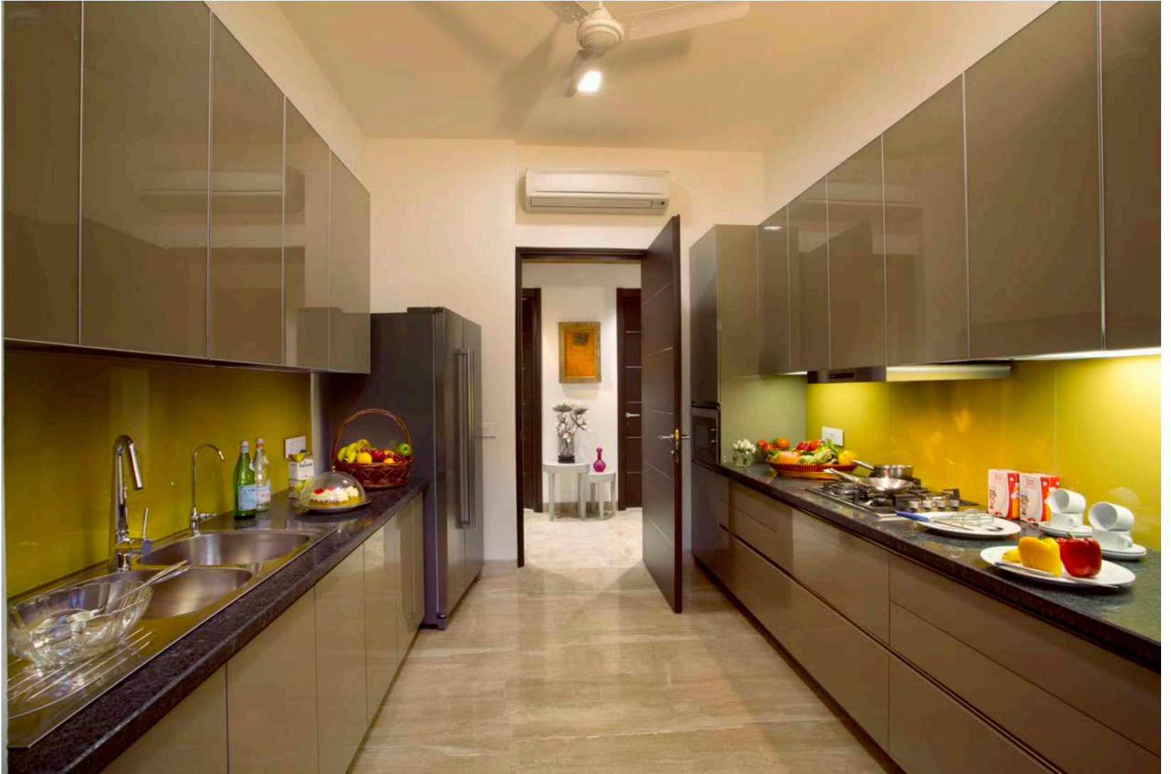
Actual sample flat image