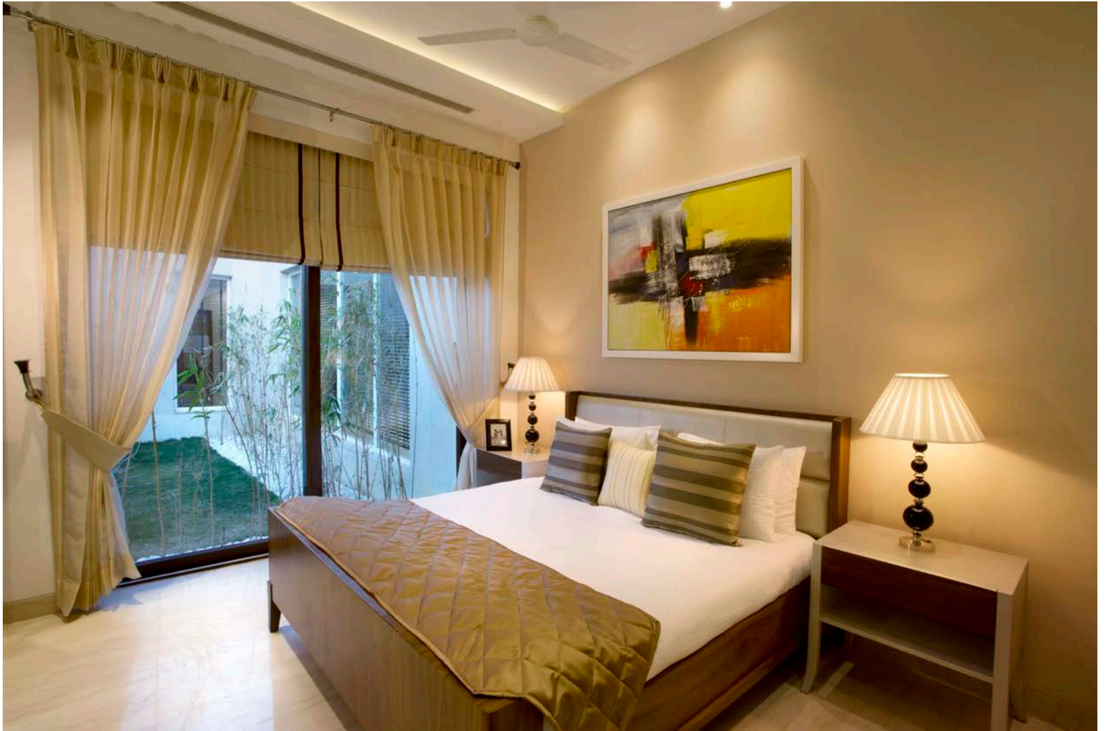
Actual sample flat image