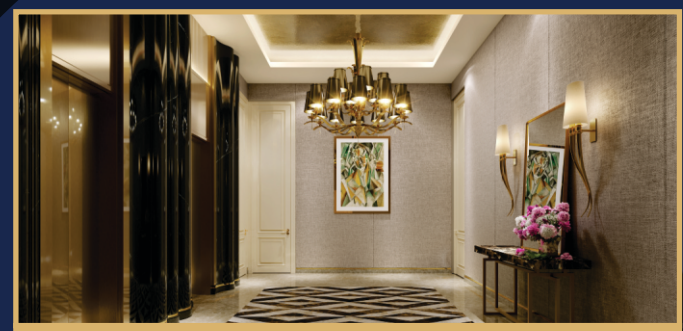
Luxurious lift lobbies with Hi-speed access control elevators, piped music & doors with extra height