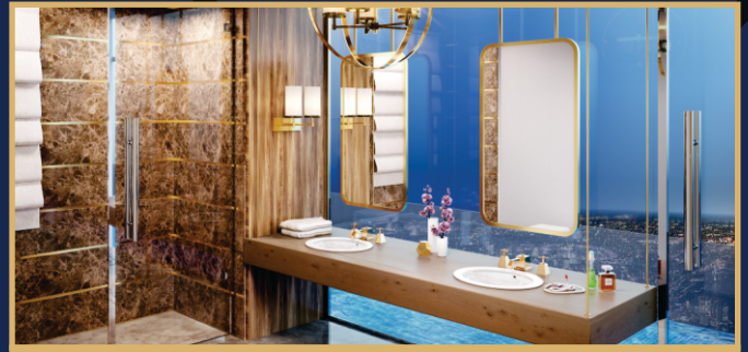
Ordinary restrooms have bathtubs. These ones have Lap Pools, overlooking the city lights