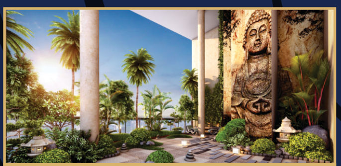
The gardens at The Sky-lounge -Double the height, double the fun!