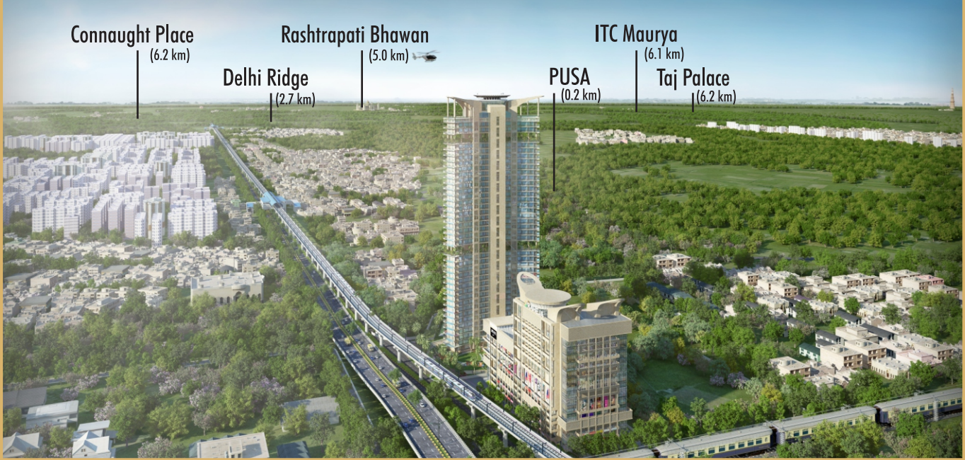
Overlooking PUSA Greens, Delhi Ridge, Lutyen's Bungalow Zone and other Landmarks of Delhi All the above mentioned kms are aerial distances

These Uber-Luxury Residences have been planned for HNIs/VIPs Register yourself at www.thetallest.in